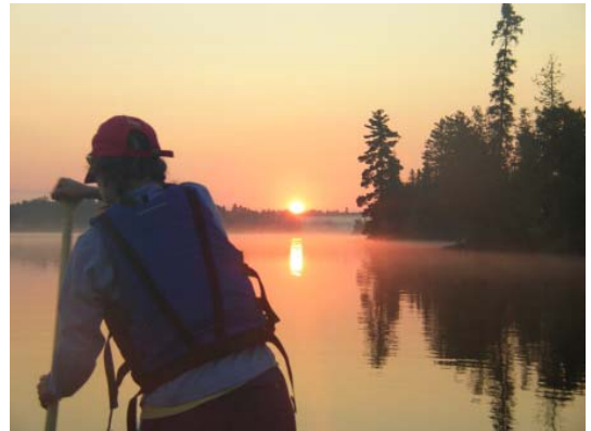
Paddling into the wild.

* Canoeing, kayaking, hiking, evening campfires, local field trips